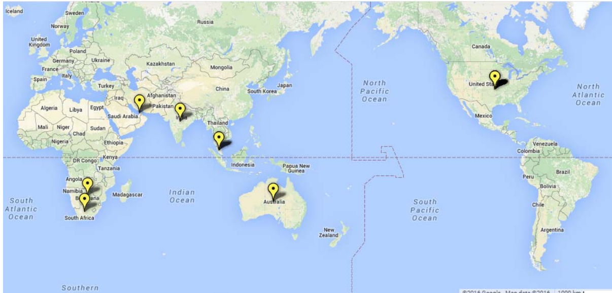
Figure 1: Geographical distribution of the 13 articles