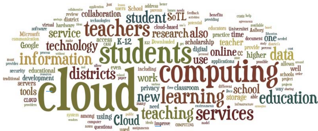
Figure 2: Word cloud of the keywords (generated using www.wordle.net )

Figure 2 is a representation of the keywords that are used most frequently in the 13 articles. This word cloud creates an immediate overview of the essential themes from the articles.